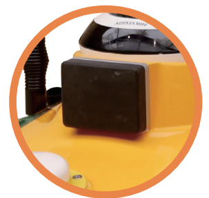
Millimeter wave radar