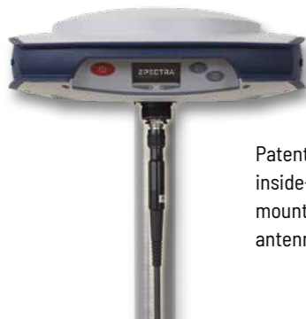
Patented inside-the-rod mounted UHF antenna design